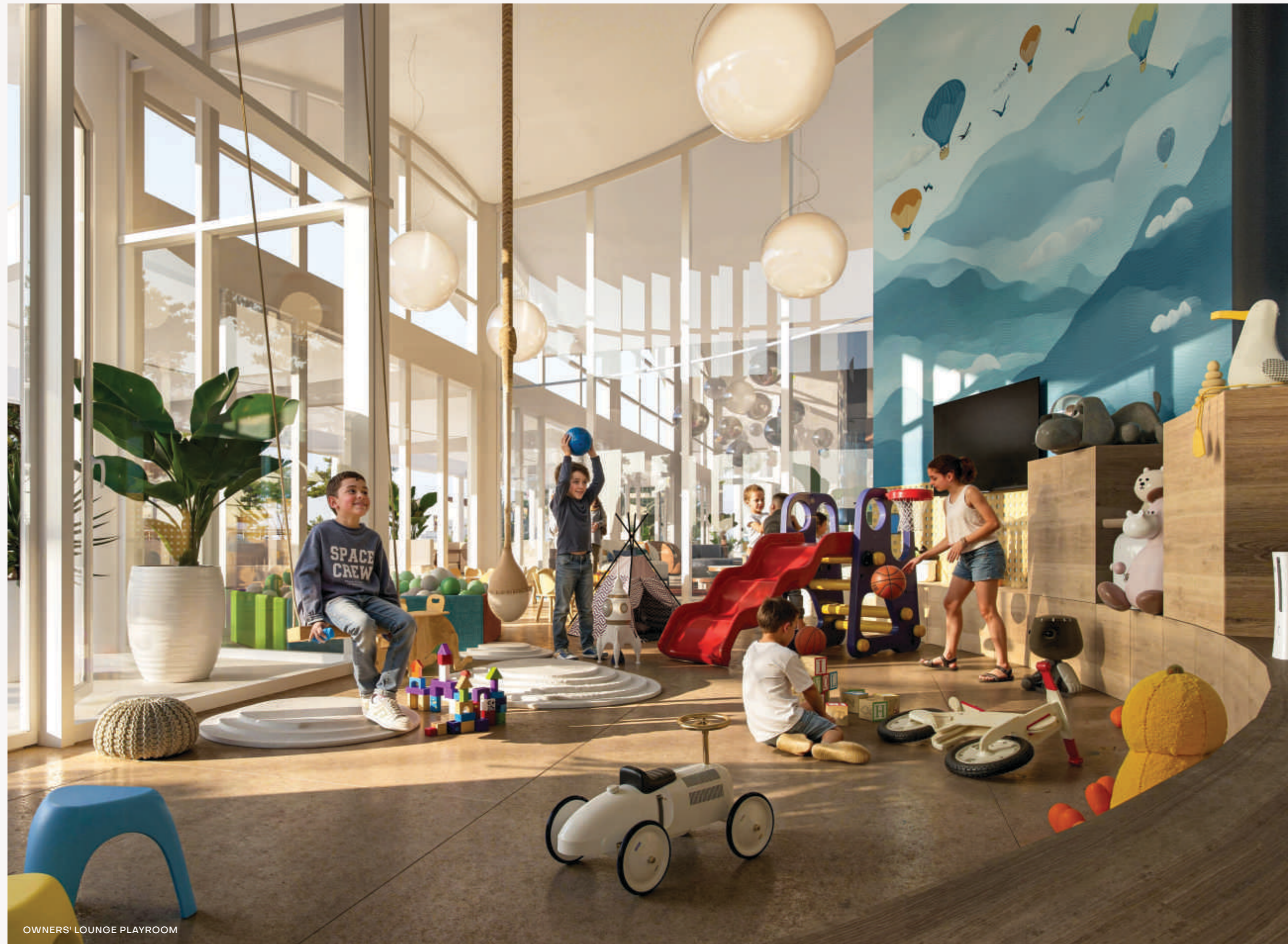
OWNERS' LOUNGE PLAYROOM

At Mövenpick Residences Kvarner Bay, children have a world of their own to discover. In the Owners' Lounge, a colourful playroom invites them to imagine, create and explore, while parents unwind in comfort nearby. Across the resort, little ones find joy in vibrant play areas and splash pools, while older children enjoy games rooms equipped with PlayStations. Even by the pools and along the beach, special corners are thoughtfully designed to make every family moment joyful.