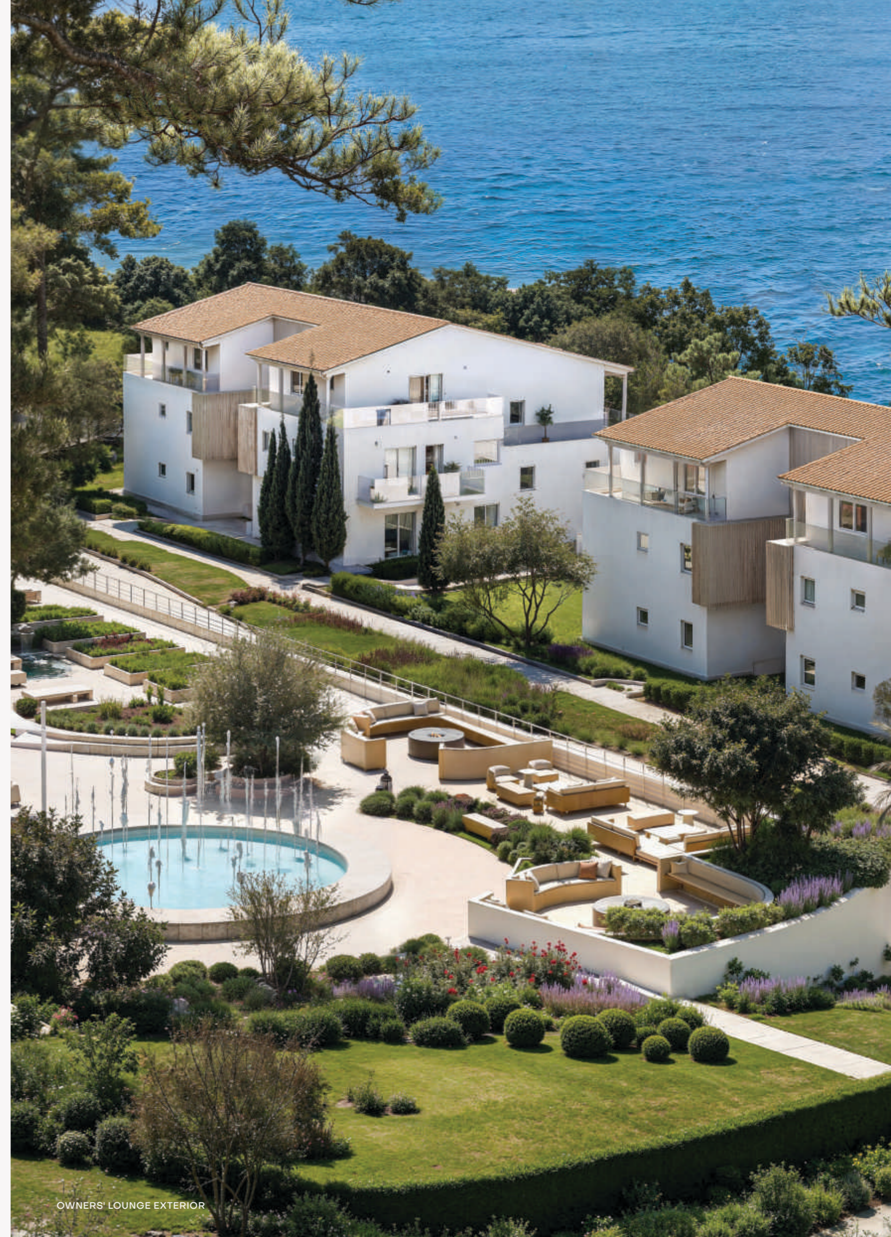
OWNERS' LOUNGE EXTERIOR