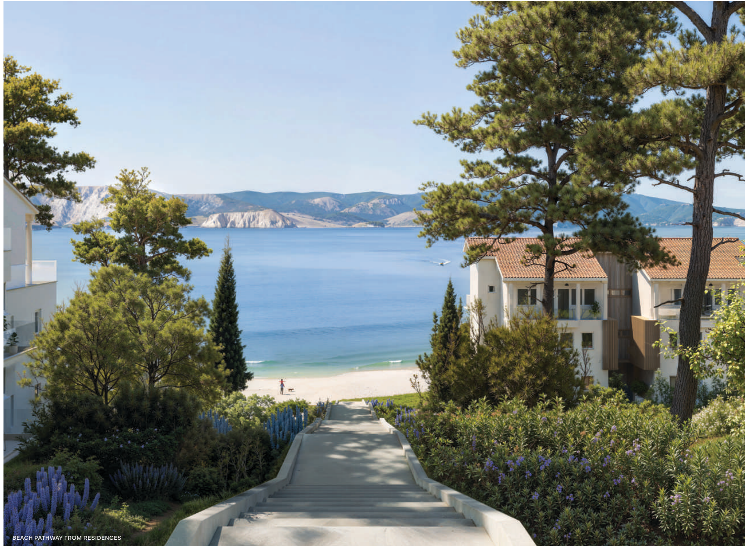
BEACH PATHWAY FROM RESIDENCES

Life here is shaped by choice and comfort. Pools, spa, and restaurants offer leisure and flavour, while families, children, and quiet corners each find their place. Every space adds to the rhythm of a resort designed for every mood.