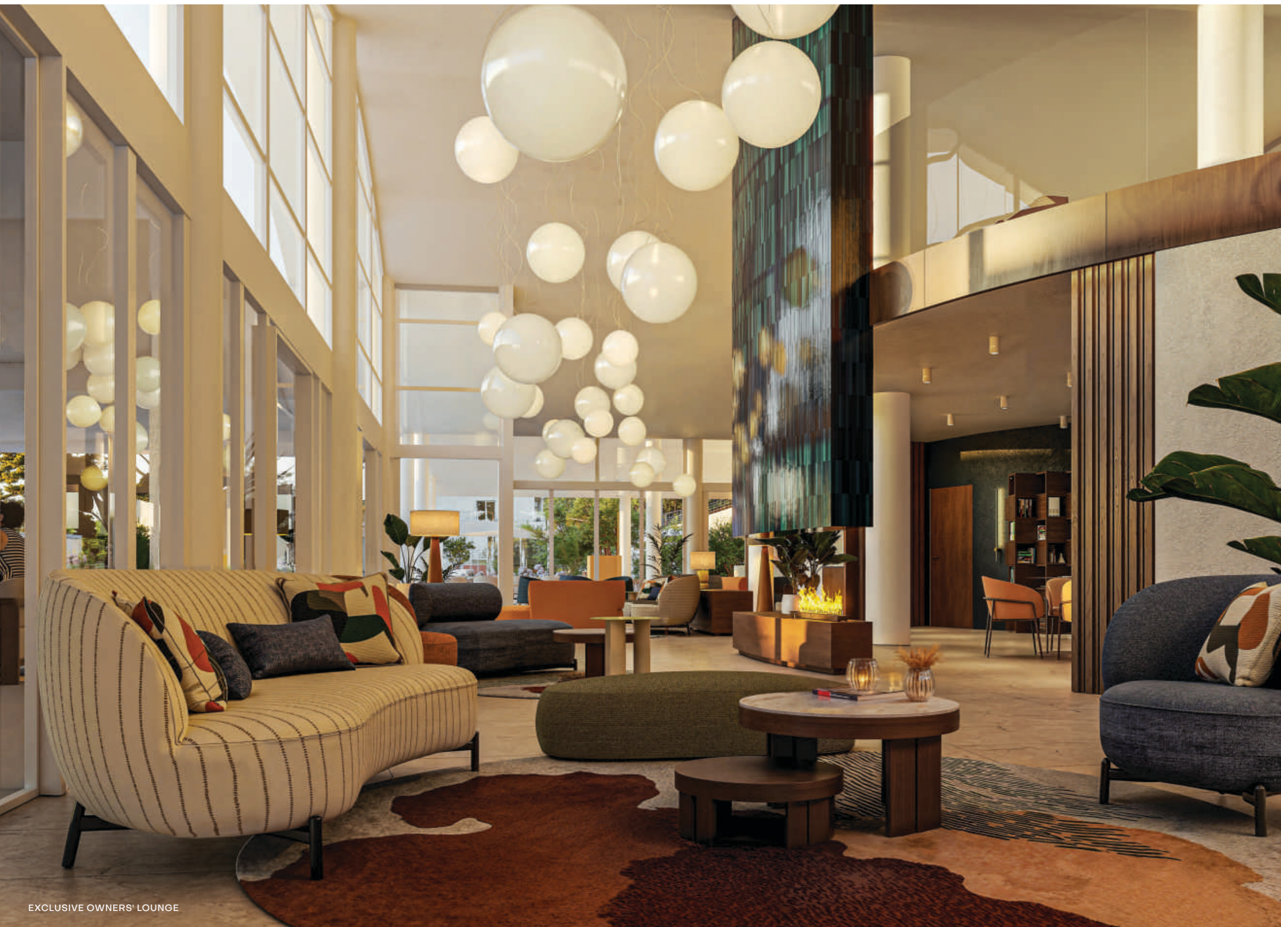
EXCLUSIVE OWNERS' LOUNGE

The Owners' Lounge offers spaces to relax, meet, or work. Concierge services are available day and night, assisting with planning and arrangements. Dedicated co-working areas make it simple to combine business with leisure by the sea.