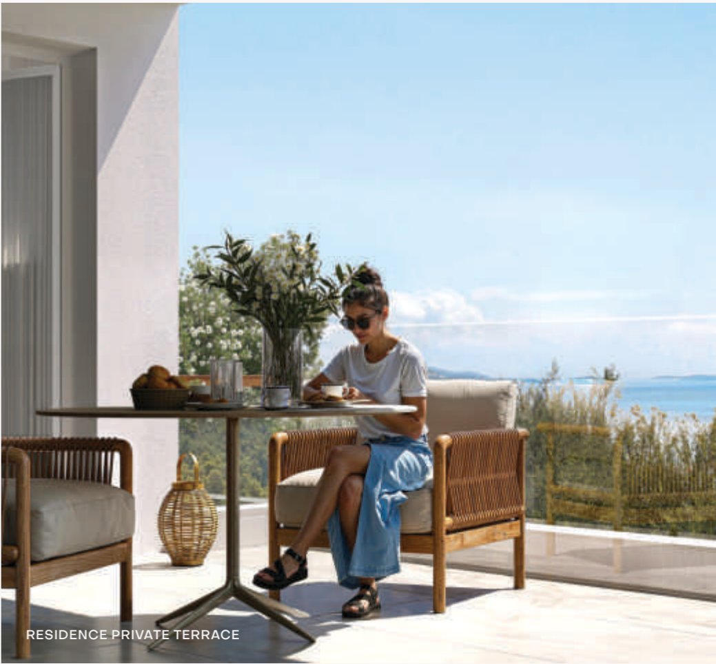
RESIDENCE PRIVATE TERRACE

Branded Residences include an opportunity to participate in the optional rental pool, designed for owners who choose to enjoy their home only occasionally. When not in use, residences can be placed in the hotel rental pool. Operated under a Mövenpick franchise, this ensures the brand's hallmark standards of care, maintenance, and quality are upheld.