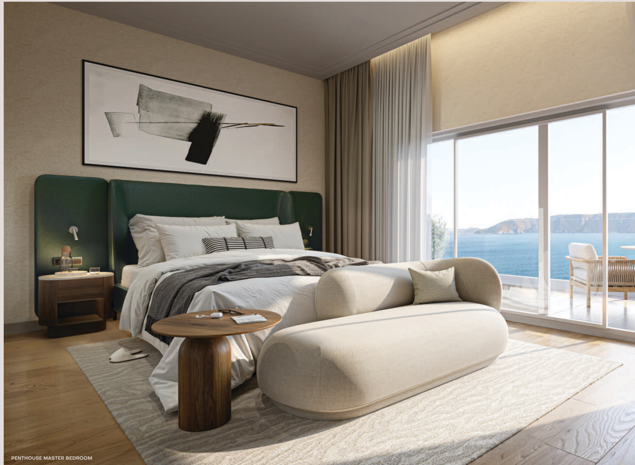
PENTHOUSE MASTER BEDROOM

With layouts from 102 to 129 sqm, the penthouses are defined by space and sweeping Adriatic views. Expansive floor-to-ceiling windows flow onto generous terraces, where the sea becomes part of each day. Inside, quality speaks through impeccable finishes, refined materials, and a contemporary design language that brings warmth and light to every surface. Designed for shared moments of togetherness as well as for privacy, these homes offer the rare privilege of elevated coastal living.