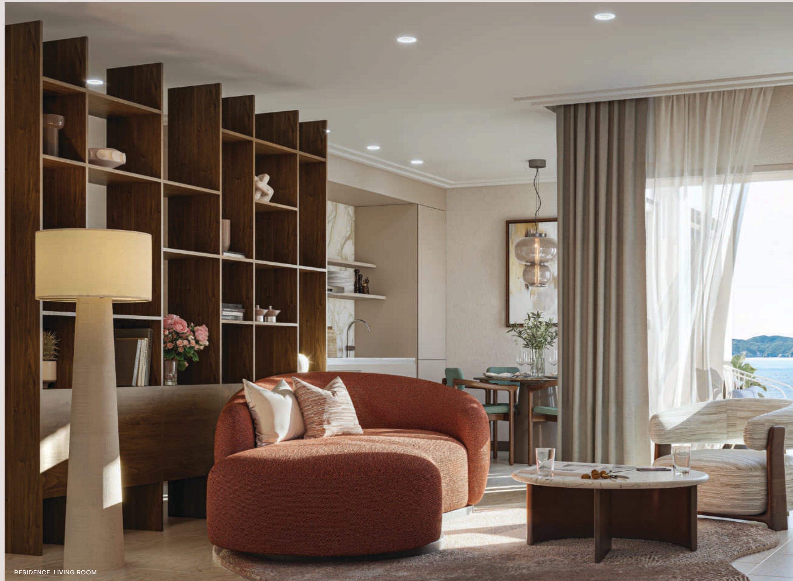
RESIDENCE LIVING ROOM

Balconies and terraces extend the feeling of space outdoors, while refined finishes and gentle design details bring a quiet harmony that feels naturally at home.