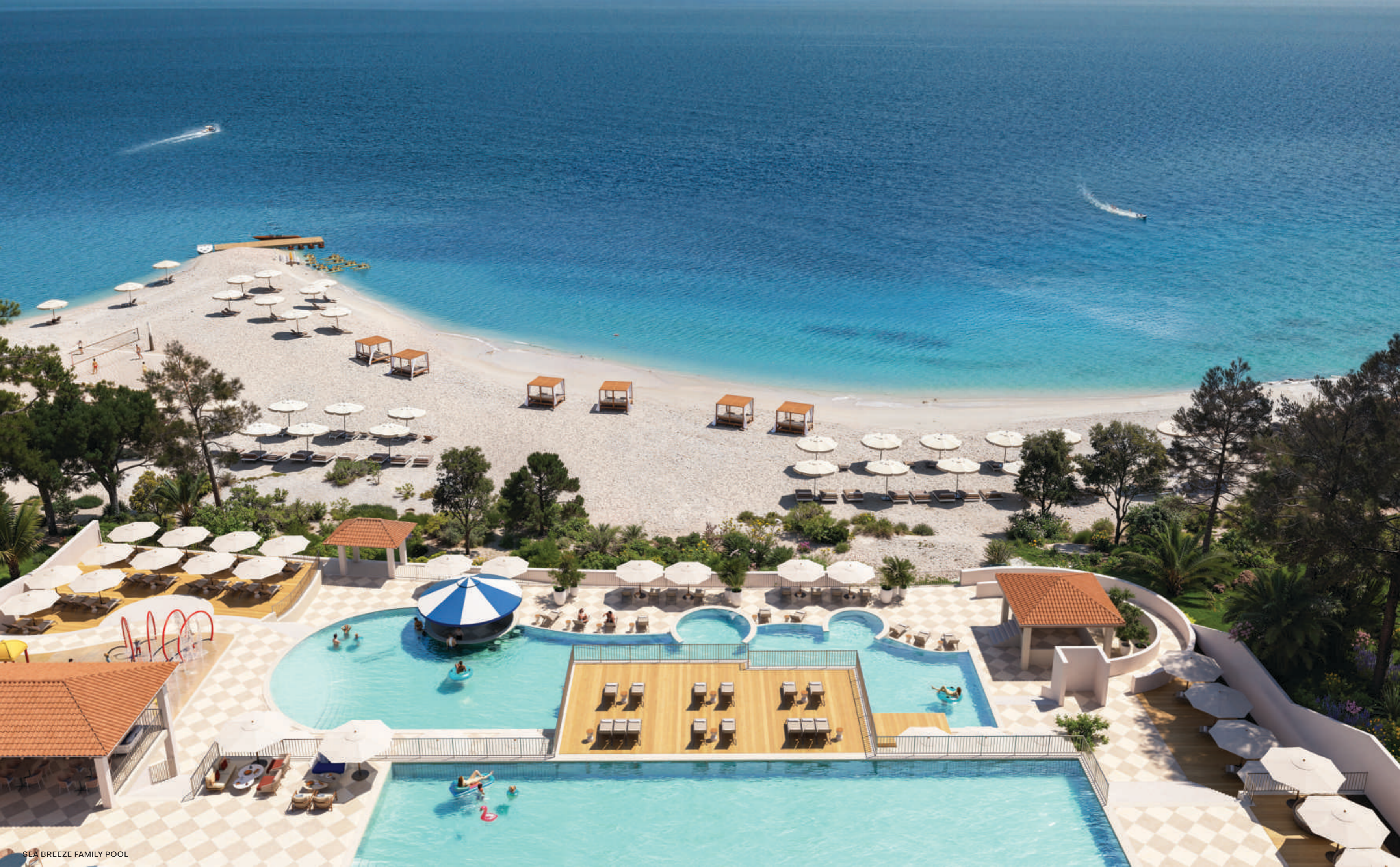
SEA BREEZE FAMILY POOL